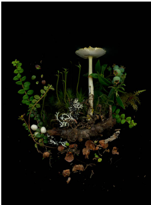
Julya Hajnoczky, Hygrocybe flavescens 2 , ed. of 15, archival pigment print, printed in 3 sizes

in conjunction with The Exposure Photography Festival